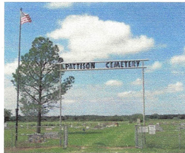
Cemetery Photo Added by: Pete Rost